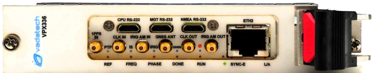
Figure 3: VPX336 Front Panel View