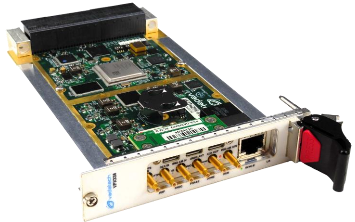
Figure 1: VPX336

The VPX336 provides standard NMEA format via RS-232 for external devices.