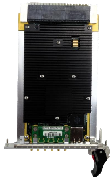
Figure 2: VPX336 Top View